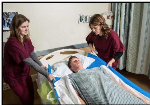
Adjust Air-transfer Mat