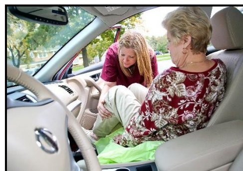
Assist Out of Vehicles